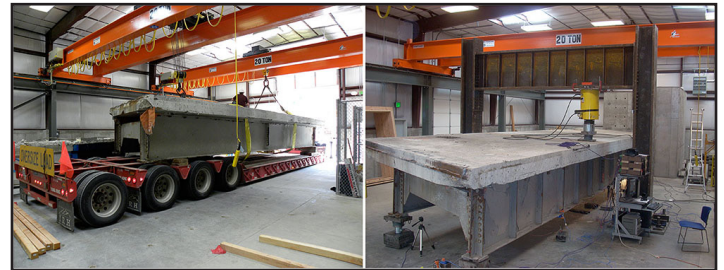
Full-scale decommissioned PBES specimens transported (left) and then tested in USU SMASH laboratory (right).

As ABC implementation becomes standard practice, nationwide research—such as that conducted by USU—will be vital to ensuring proper construction and longevity of these structures.