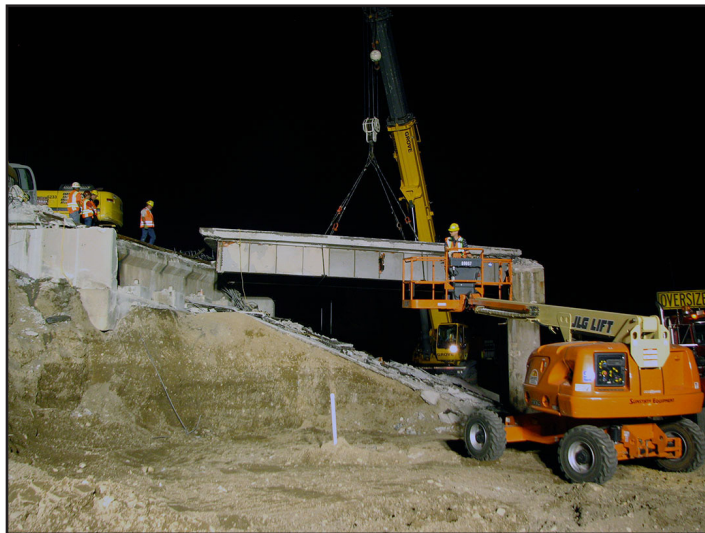
Utah State University

Unlike traditional construction that could take months to complete, ABC technologies help replace bridges more quickly and cost-effectively. EDC2 promotes three methods of ABC: Prefabricated Bridge Elements and Systems (PBES), Geosynthetic-Reinforced Soil – Integrated Bridge System (GRS-IBS), and Slide-In Bridge Construction. Each of these implements a combination of state-of-the-art techniques and materials to expedite construction schedules, minimize congestion, reduce construction costs, and improve safety for construction workers and motorists.