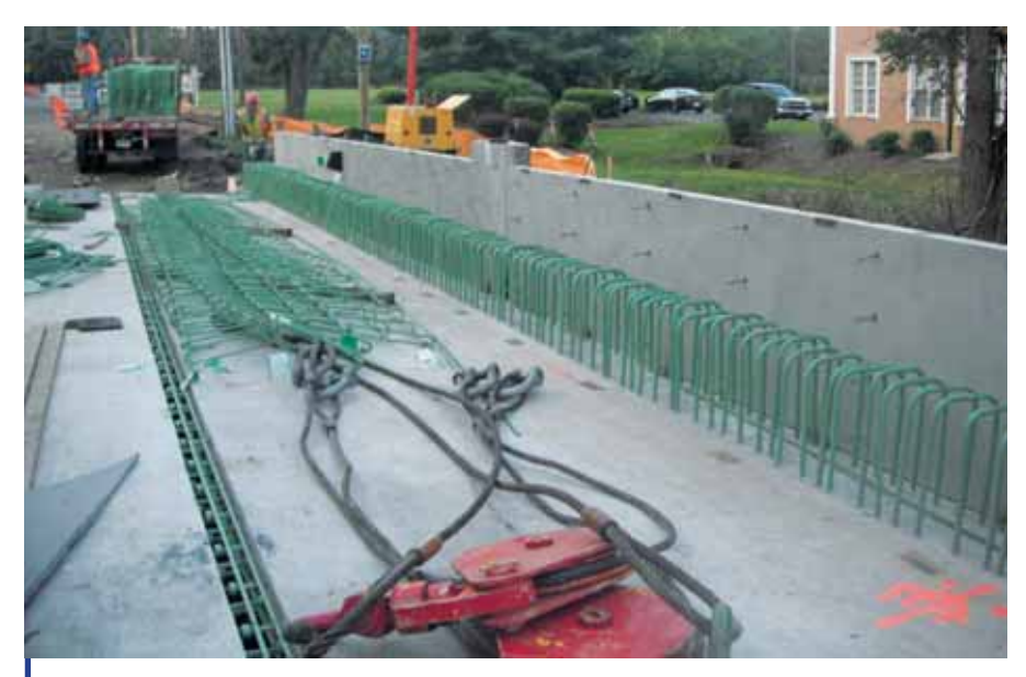
Four new 92-ft-long precast superstructure units consisting of dual steel-plate girder stringers in composite action with a reinforced high-performance concrete deck were installed atop new bearings. The longitudinal joints were filled with quick-setting cement.

An asphalt bridge deck waterproofing surface course was placed over the bridge once the parapets were installed. There was significant discussion during design on whether to use an asphalt overlay on a newly constructed bridge deck. Even very minor differences in elevation would be noticeable on the exposed deck. Given the rapid construction, there would be little time to correct any elevation issues should they arise. The asphalt was eventually used since it can be compared to icing on a cake that would smooth out any imperfections to the motoring public. The final elevations on the concrete deck did come out near