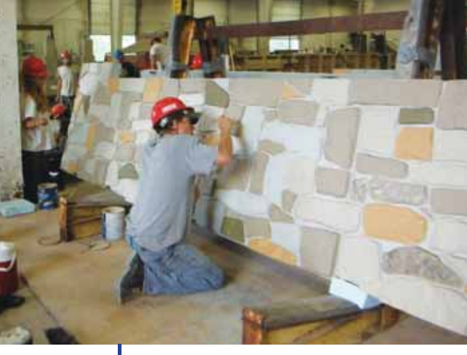
A unique design was developed that utilized architecturally treated precast panels resembling natural stone construction to blend in with the historic nature of the area. The parapet panels served as permanent stay-in-place forms for the cast-in-place concrete core between the panels.

a new substructure and superstructure in less than seven days under a full roadway closure.