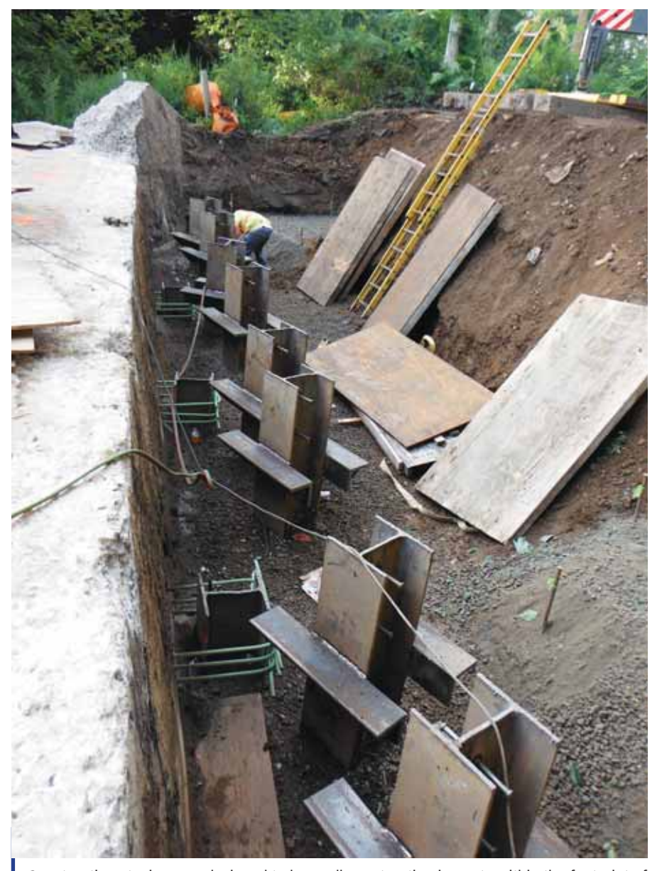
Construction staging was designed to keep all construction impacts within the footprint of the existing road and bridge. This resulted in no disturbance to the surrounding area.

Continuous construction commenced on Saturday, Aug. 18, at 7 p.m. with the demolition of the existing superstructure. Only the backwall of the substructure required demolition to allow for passage of the new superstructure. The piles, driven nearly six months prior, were excavated and cut to the proper height. The support angles