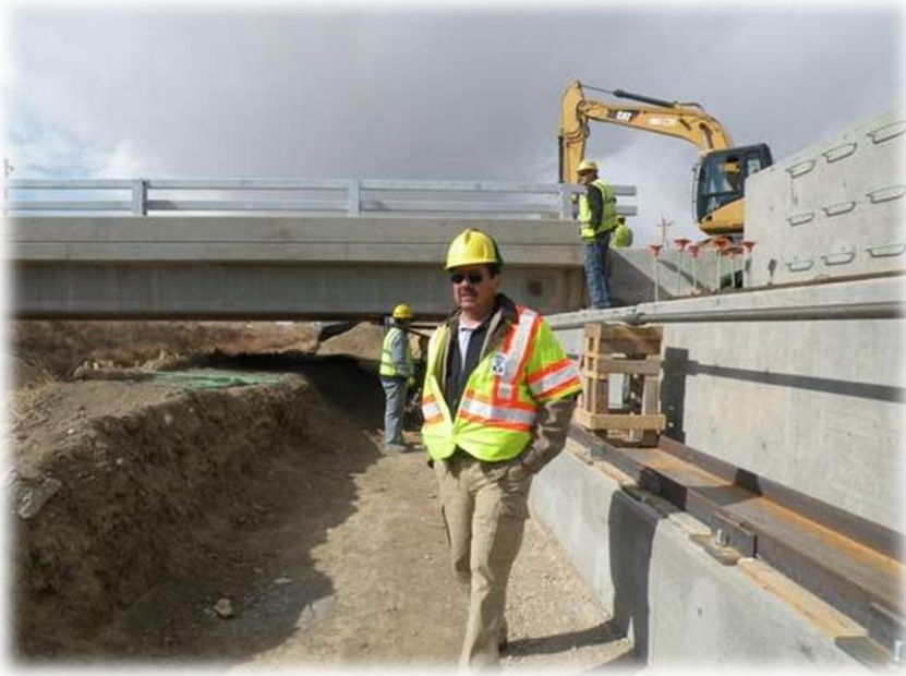
Figure 1.4: Fort Lyon Canal Bridge

The original State Highway 266 Fort Lyon Canal Bridge was built in 1954, and spanned 90'. This bridge was selected for replacement due to being declared functionally obsolete and structurally deficient. A replacement Fort Lyon Canal Bridge was built using the CM/GC delivery method and was constructed next to the original structure. The structure utilized Accelerated Bridge Construction (ABC) techniques to negate issues to the traveling public. The super structure was rolled into place by using a temporary abutment and bridge rolling technology. This structure is located in a rural area with minimal space constraints, which proved beneficial in allowing the structure to be built adjacent to the existing structure. The 90' bridge has a projected lifecycle of 75 years; the Fort Lyon Bridge Deck has a total of 3510 SQ FT and Average Daily Traffic of 809 trips. Construction began on November, 27 2012 and was completed in April 26, 2013 (5 months), weather was not a defining factor in duration. The total award amount for the Rocky Ford Bridge Project was $4,299,627.00 of this $813,647 was