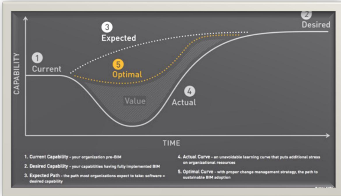
Figure 1.1: BIM Implementation Learning Curve

http://www.aecbvtes.com/viewpoint/2012/issue_65.html