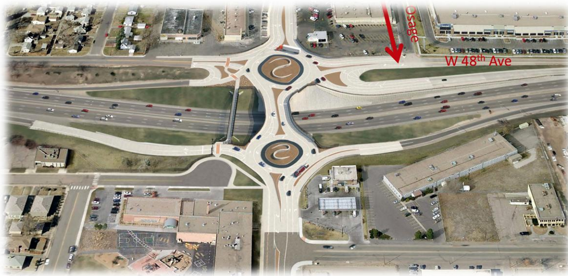
Figure 1.3: BIM Model showing all converging streets and the need for the roundabouts

BIM was utilized on the project from conceptual design through construction. Specifically the bridge design consultant Wilson, and Kiewit the contractor, utilized the BIM processes through the software Midas Civil ("Midas civil integrated," 2013). The project's cost was affected directly due to the purchase and learning curve of this software. Kiewit used this software to model the bridge and associated lifting diaphragms. This was to determine how the specific lifting points might be affected due to the associated stress and pressure. They looked at overall longitudinal design, shear, torsion, and maximum twist and the impact it would have on the differential or deflection. The super structure required four (4) types of post tensioning including longitudinal internal tendons, longitudinal external tendons, vertical tendons in the diaphragms, and transverse deck tendons ("Pecos street bridge,"). By modeling this they were able to determine that if they went greater than a .25 inch there was an extreme chance of damage. Modeling also provided a means for them to determine how they would put them on the Self Propelled Modular Transport Vehicles (SPMTV) from the jacks that they had to utilize in order to lift the structure straight up in order to not damage these points on the bridge. The Pecos