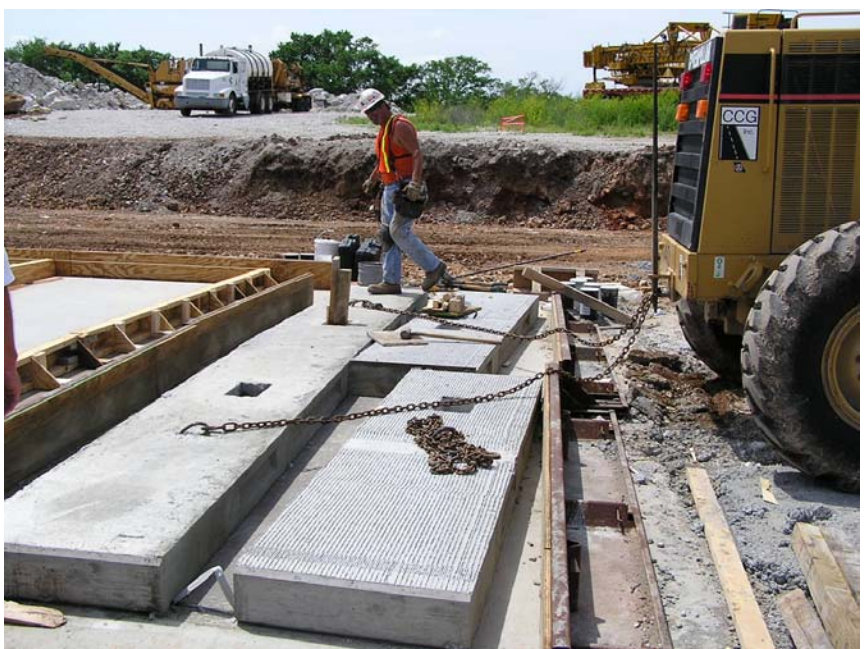
Figure 3: Trial match-cast sections showing keyways on both sides of panels. One side against forms and one side against concrete.

A process called "match casting" was used. After the first panel was poured the forms were removed from the edge that would butt up to the next panel. The adjoining edge had the concrete for the second panel poured against the keyway that was originally formed in the first panel, so that the pieces would fit perfectly. The joint between the two panels had a release agent applied to it so when the concrete cured they could be separated. Each adjacent panel was formed in the same way until the pieces for that continuous span were complete.