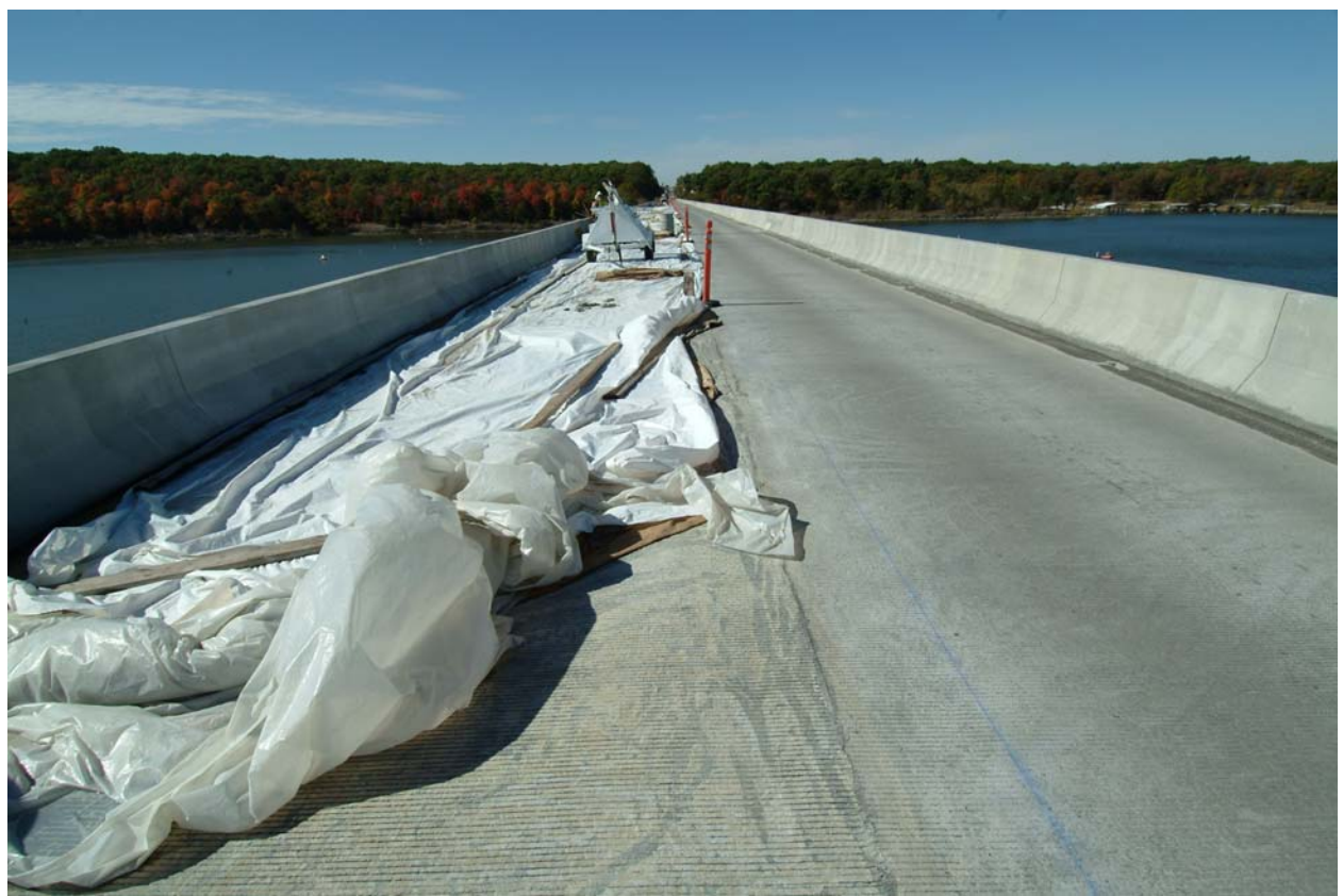
Figure 18: Uncovering the last of silica fume overlay placements.