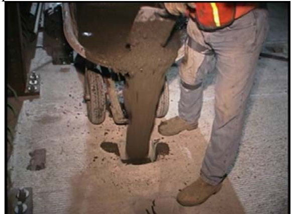
Figure 14: Pouring grout into 2nd of 4 blockout holes per girder line in precast panel.

The contractor re-used the old posts and channel rails as a temporary guardrail from the new deck panels to original guardrail. He also added a bottom rail to protect the rebar cast into the panels for the new concrete barrier curb.