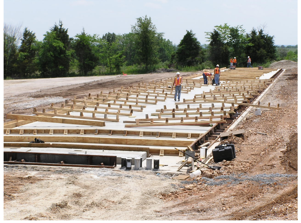
Figure 2: Casting bed – laying out forms for 10 ft. sections.

A casting bed 29 ft. wide by 360 ft. long was built on a nearby abandoned quarry just south of the project. Unlike building a regular bridge deck in place where long lengths can be readied for pouring the concrete, this job required 164 individual 10 ft. panels. For panel construction, jigs were made to help place the two layers of reinforcing steel. Then 8 tubes had to be cast into the concrete to hold the PT (post –tensioning) bars that would secure the panels together. Foam block outs were needed to create pockets where shear studs would connect the panels to the structural steel girders. Pockets were also needed around the ends of the PT bars to allow for tensioning after the panels were set. Later the pockets and blockouts would be filled with grout. ( See Figure 3. )