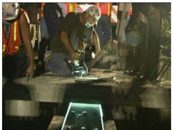
Figure 12: Welding new shear studs to steel girder through blockout.

The bars were tensioned two at a time using special hydraulic jacks until all were tensioned. Two jacks were used to tension the bars to keep tension equal across the face of the concrete sections.