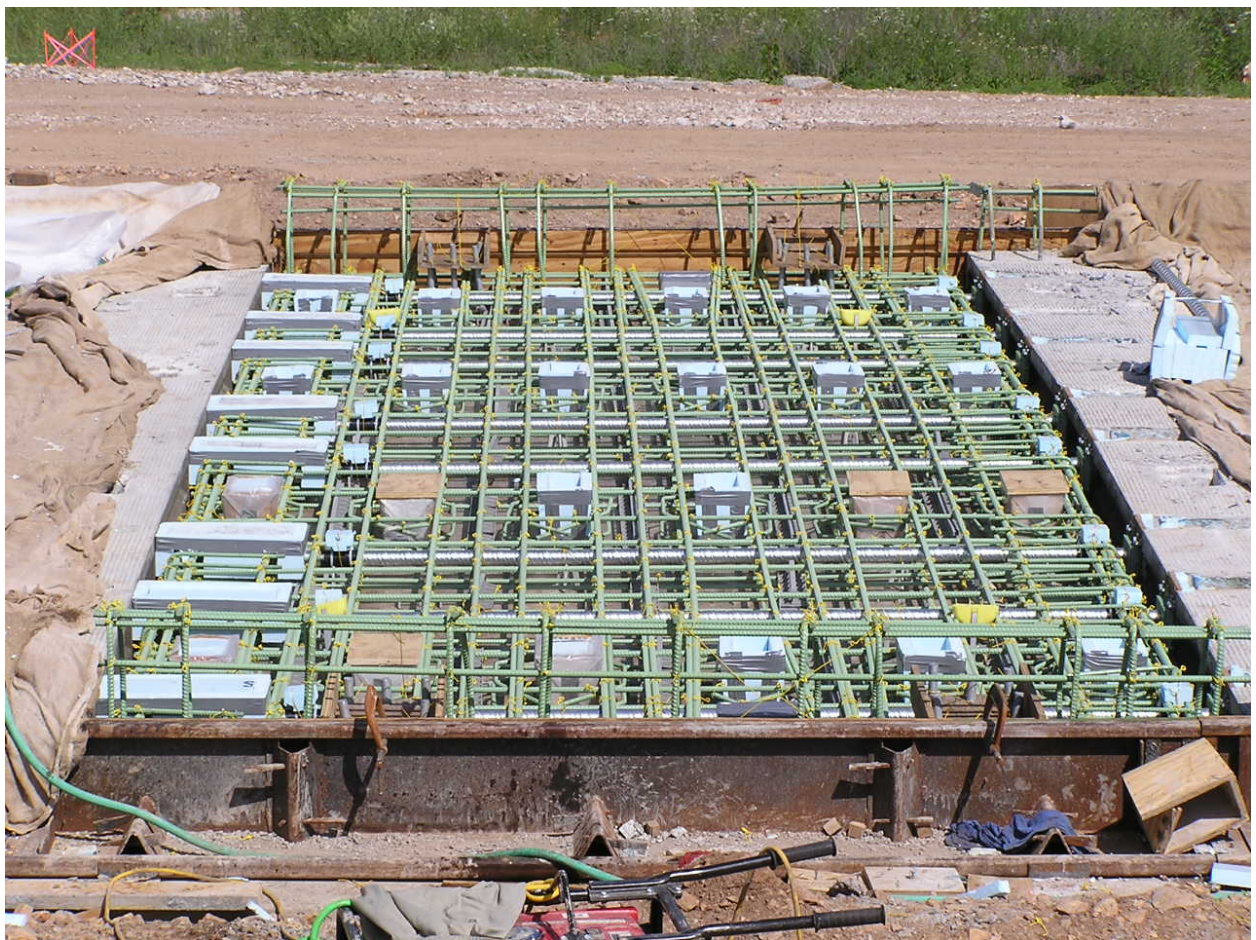
Figure 4: Rebar cage (w PT Tubes and foam blockouts for shear studs, etc.) had to be placed for each 10ft. section before placing concrete. Note this panel is being match cast in between two previously cast panels.