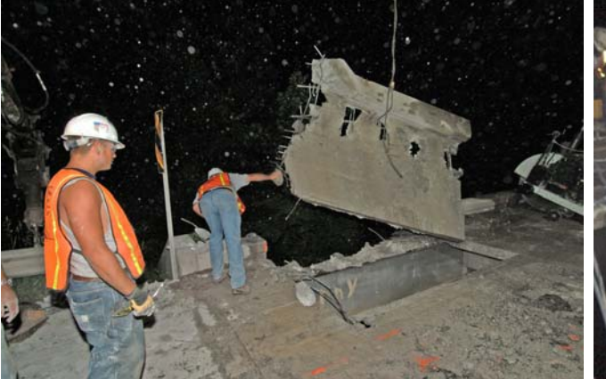
Figure 7: Removing first section of old concrete deck.

The old deck was held in place by steel shear studs welded to the top of the I-girders. The concrete was poured over the rebar and the shear studs, which connected the deck to the girders. This design is called composite construction, which helps the deck work with the I-girder superstructure so that the bridge can hold more weight. These studs had to be located and the concrete around them removed. Large concrete saws were also used to cut through the 7-inch thick deck and the curbs to get them in moveable sections. Then a crane would lift out the old deck. (A crane located on the road was used to set the first few panels near the south abutment. After the first few panels, barges in the lake were used to hold the crane, store the removed old deck, and hold the new precast panels. The crane placed the remainder the deck panels from the barge in the lake.) The tops of the girders were cleaned off and the old shear studs removed. Finally fast drying epoxy paint was applied to the tops of the top flange of the existing steel girders.