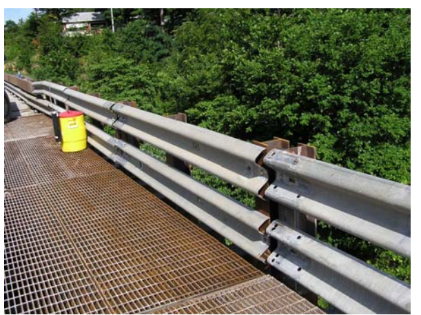
Figure 10: (In background) Temporary guardrail transition to existing guardrail.