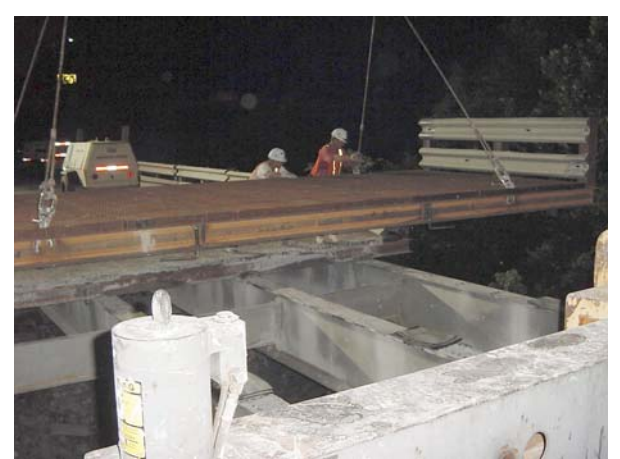
Figure 9: Installing temporary deck panels.