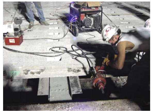
Figure 13: Post tensioning sections together. (Note: only one of two rods being tensioned to 90,000 lbs. at same time is shown)

Last, the haunches were grouted through the shear connector pockets each night after the panels had been post tensioned. A special packaged fast setting grout mix was combined with \frac{1}{2} " sized aggregate to form the flowable grout. The grout also was used to fill the shear connector pockets and the block outs around the PT bars. The grout was required to reach 4,000-psi strength. The grout set up within a couple of hours so that the deck could be open to traffic at 7:00am the next morning.