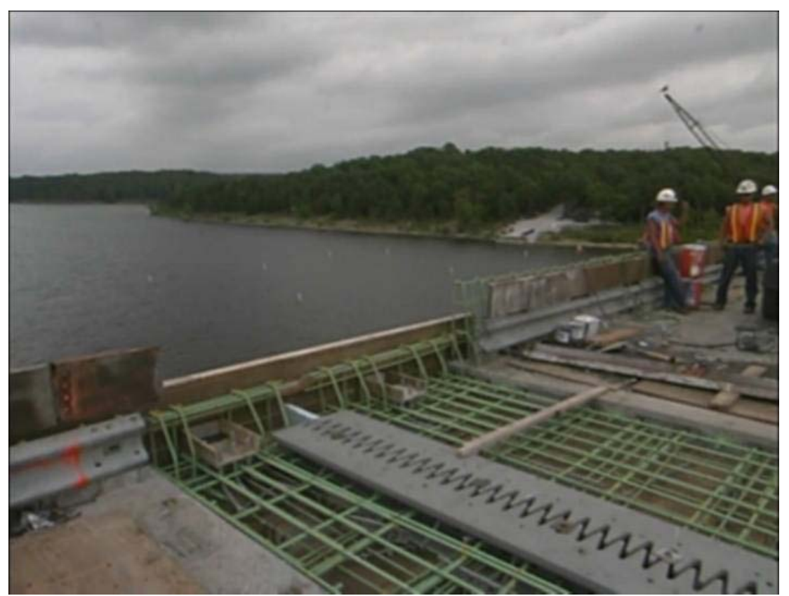
Figure 16: getting ready for placement of concrete between precast sections and around new finger expansion joint.

After all the deck panels were set in place, there were closure pours needed between the continuous spans at the piers. These concrete pours were done on the bridge where expansion joints were being replaced, and filled in the gap between the end of the deck panels and the expansion joints. These pours were done one lane width at a time and then covered with a steel plate allowing traffic to pass over them.