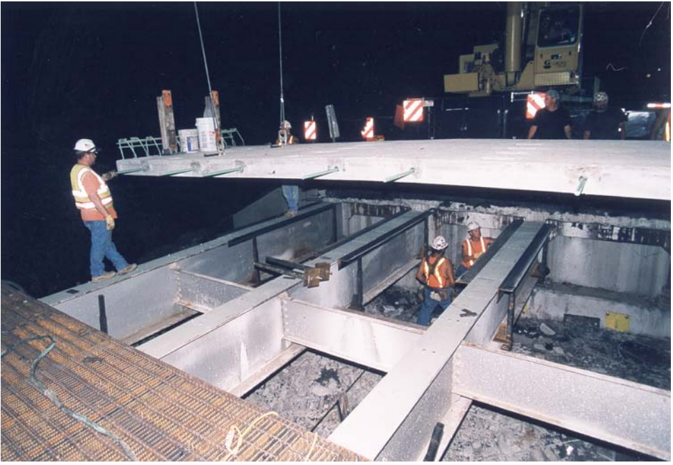
Figure 11: Setting the first precast panel, Note: Workers under bridge are adjusting jacks for the haunch forms to match the crown cast into the bottom of the deck and bring to proper grade before filled with fast setting grout. Note: Temporary steel deck panel in place in foreground.

The top of the panels had been textured, when cast, with transverse tining to provide a skid resistant riding surface and later on to provide a good bond when the 1 \frac{1}{2} silica fume overlay was placed.