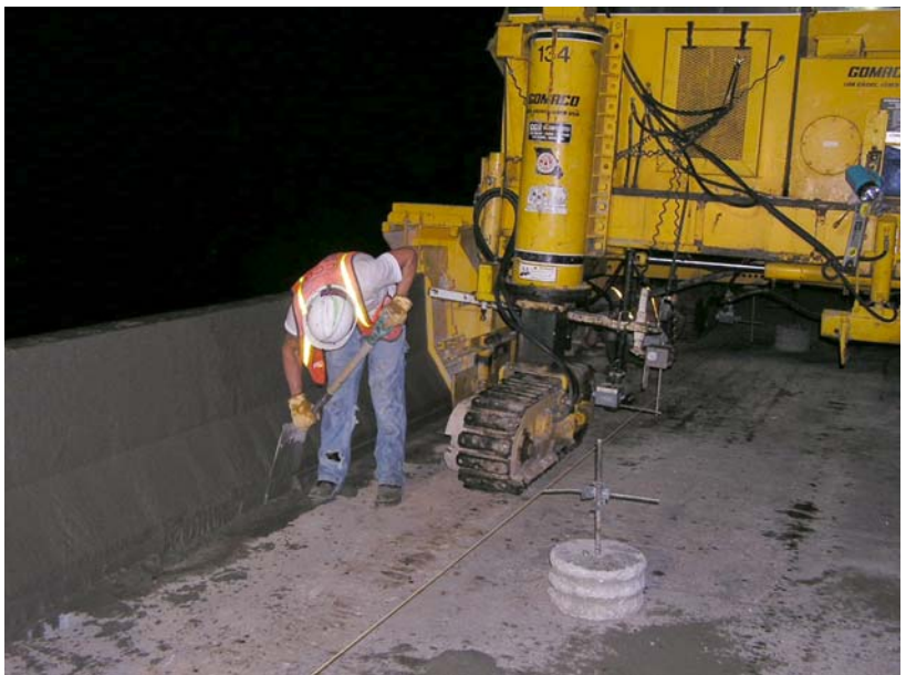
Figure 17: Placing barrier curb by slipform method.

Once the closure pours were in place, the permanent reinforced concrete barrier curb was poured by the slip form method. The barrier was started on the south end of the bridge even before all of the panels had been finished being placed on the north end just before Labor Day. The remaining rebar for the top of the barrier was tied during the day and the concrete poured at night.