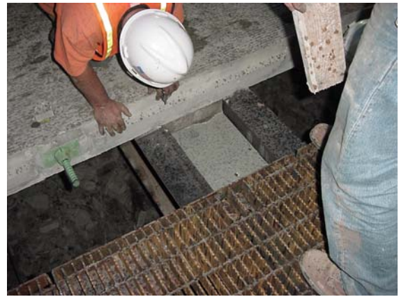
Figure 15: Removing 2x4 used to form end of haunch after grout set in about 2 hours.