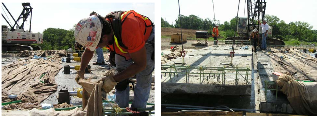
Figure 5: Jacking match-cast panels apart using square steel posts set in blockouts on each side of joint with release agent Note: keyways showing on edge of opposite panel. applied to it