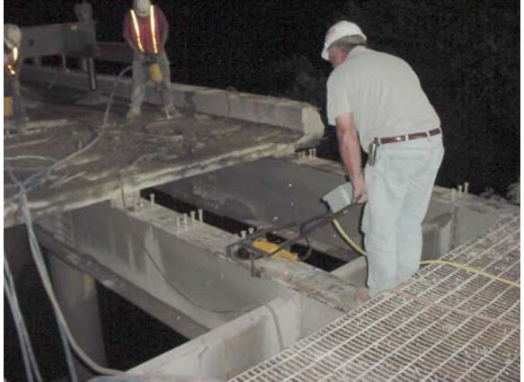
Figure 8: Background – Jackhammering around shear studs to loosen old deck Foreground – Sawing off steel shear studs after old concrete deck removed.