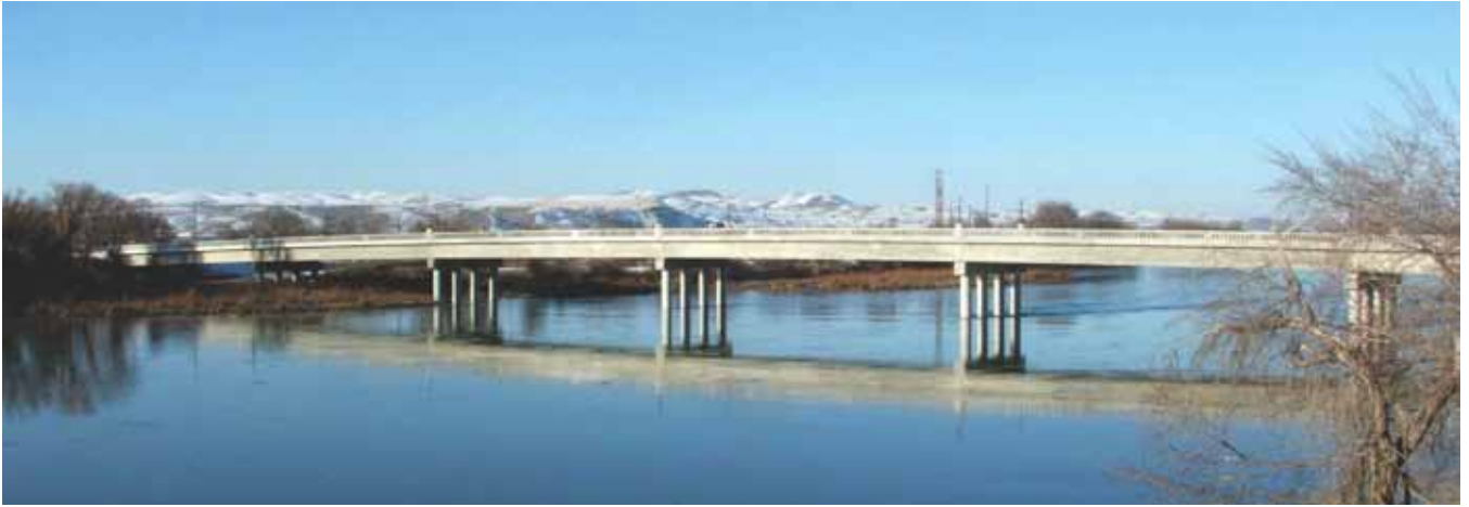
The U.S. 95 Spur Bridge over the Snake River features six spans of precast, prestressed concrete modified bulb-tee girders 144 ft long and 84 in. deep.

girders. The 144-ft girders are the longest yet to be used in Idaho, and they were selected while working closely with city officials to replicate the look of the original bridge. A cast-in-place concrete railing was provided, along with vintage light standards to create the proper tone.