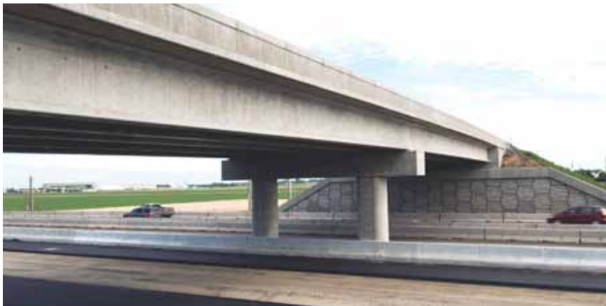
Precast concrete bent caps and columns were used on the Robinson Road over I-84 Bridge, one of several recent projects to incorporate accelerated bridge construction (ABC) techniques.

For more information on Idaho's bridges, visit www.dot.state.idaho.gov .