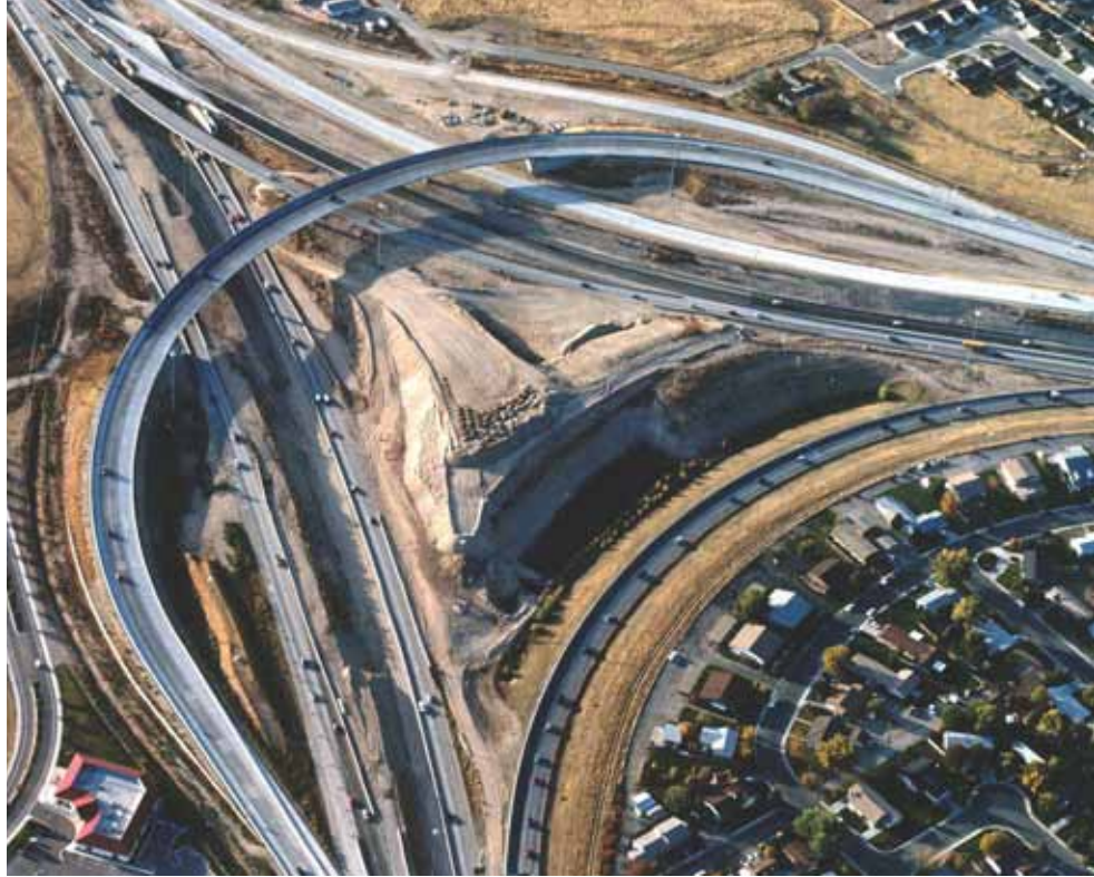
On the Wye Interchange on I-184 in Boise, the 817-ft-long, fly-over bridge features cast-in-place, single-cell concrete box girders that were post-tensioned both transversely and longitudinally.

This approach was used on three interchanges or overpasses in the past 2 years, on Black Cat Road, Robinson Road, and the Vista Interchange over I-84 in Boise. The two overpasses feature precast, prestressed concrete girders, precast concrete columns, and precast pier caps. The Vista Interchange uses precast, prestressed concrete girders with precast concrete pier caps but cast-in-place concrete columns, because the construction staging did not benefit from accelerating the column construction. The local offices of HDR Engineering, Forsgren Engineers,