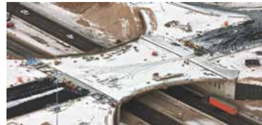
The I-84 Ten Mile Interchange in Meridian, Idaho, features a 189-ft single-span, cast-in-place concrete box girder. A single-point urban interchange (SPUI), the post-tensioned design provided cost effectiveness and constructability at the complex site.

A few components were replaced during the work, such as the end portion of some stringers. Also, the existing railing had deteriorated, so it was demolished and a precast concrete railing replaced it. As this design had to perfectly replicate the original, it was fabricated in a precast concrete plant and shipped in segments to the site to provide better control over its character and quality. All of the work was done in stages, to allow vehicle access to the bridge